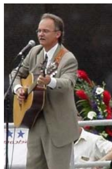
Jimmy singing "More Than A Name on A Wall" at the Viet Nam War Memorial in Washington, D. C. May 26, 2003

Not only will you have the opportunity to experience the cruise of a lifetime , but you will also be a part of the exclusive group that will be sailing with Jimmy Fortune . As part of this group, in addition to the regular shipboard entertainment, you will enjoy two special concerts by Jimmy and will join us at 2 private receptions onboard ship! Come along as we sail the crystal-clear blue waters of the Caribbean!